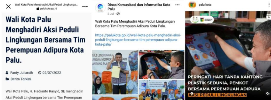
Figure 2. Similarity of news content on website platforms, Facebook and Instagram.

“The main purpose of making social media that can be said to be very close to the community is of course so that all the people of Palu City receive all information from the city government which is in line with the vision and mission. So it is hoped that if there are people who do not follow Palu.koya's Instagram, they will be able to receive the same information through other government platforms such as websites, Facebook, etc.” (Chandra, 10/06/22).