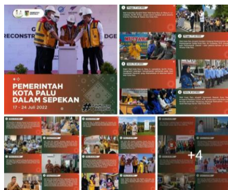
Figure 1. Palu City government posts in a week

Each platform used by the Palu City government certainly has the same ultimate goal, how every news can be consumed by the public. Each field has members who are competent in their fields such as journalists, editors, etc. So that in media management, each field plays a role according to their capacity. There is also content that is quite interesting for the public, namely posts related to "Palu City Government in a Week" where the media center routinely posts all city government activities every week. In addition, there is also a complaint service addressed to the entire community of Palu City. The technical complaint is that people access the website and then make complaints on the available pages. Hadianto Rasyid as the Mayor of Palu will immediately answer the complaint on his personal Instagram account.